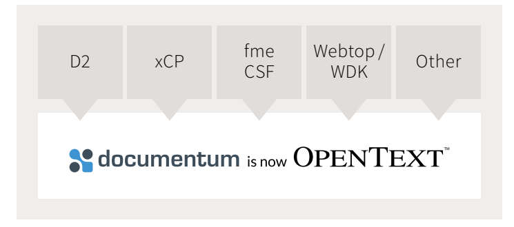
Possible clients for the OpenText Documentum platform